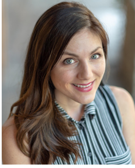
Cathy DeLaigle @cathyrush