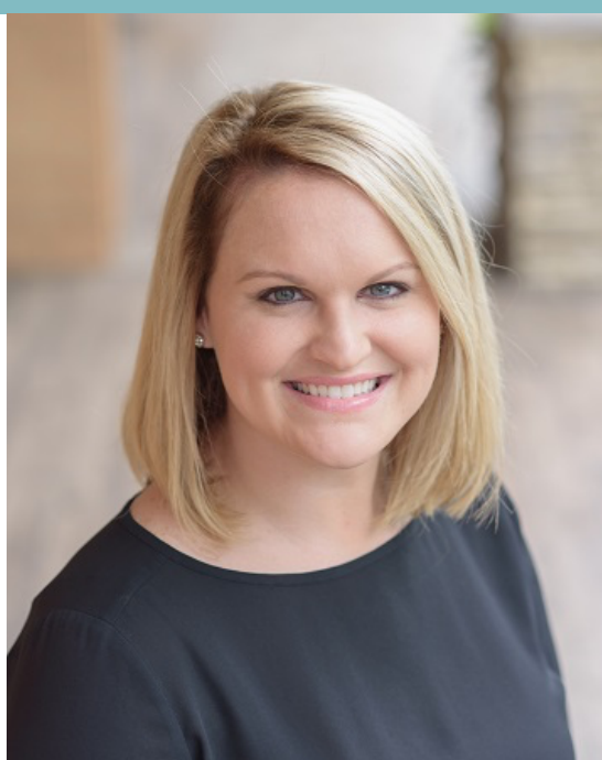
Mallory Cash @mallory_cash_design